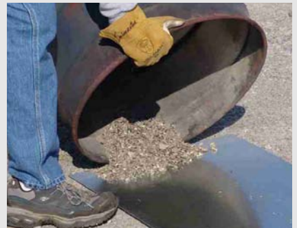
6 WASTE IS REDUCED TO 3% ASHES BY VOLUME

Ask for our instructional video, CD or DVD on the operation of the Smart Ash Multipurpose Incinerator.