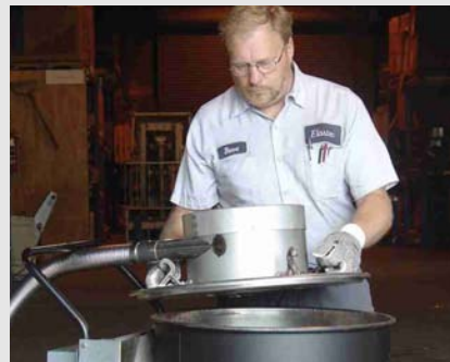
2 ATTACH AIR HOSE – REST LID ON DRUM