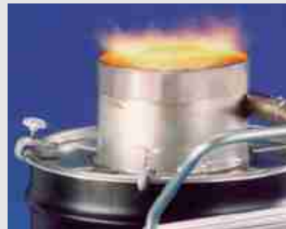
5 INCREASE AIR SUPPLY SLOWLY FIRE WILL BURN CLEAN