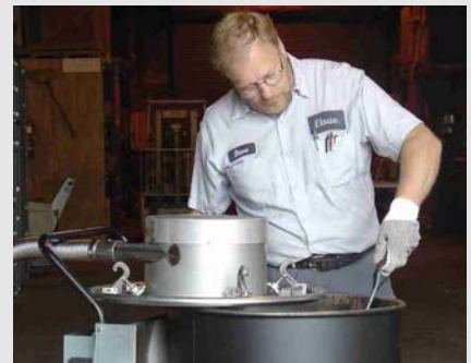
3 IGNITE LOAD - TURN ON MINIMUM AIR