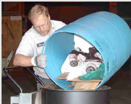
1 LOAD DRUM

Emission test data available upon request.