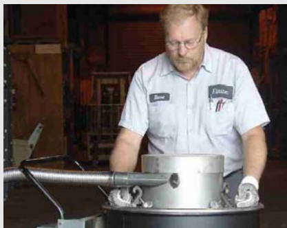
4 CLOSE & CLAMP LID